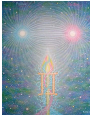
Pollux and Castor

In the three horned Signs, well symbolized by the animals, the Ram, the Bull and the Alpine Ibex (Capricorn), the two horns indicate duality, but when illumination of the mind is achieved, Their united symbol is the Unicorn. The horns are now twined into one horn, piercing glamour and illusion.